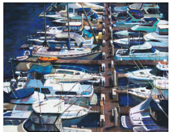
Right: 'Orange Dinghy' Pastel - 16 x 20