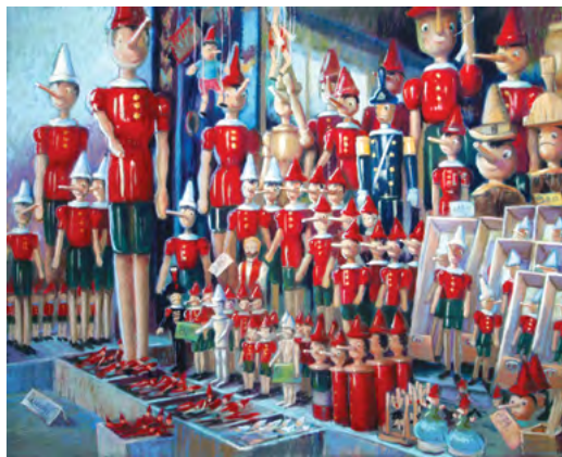
'Children of Collodi Gathering' Pastel - 16 x 20