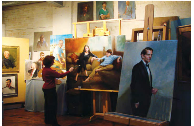
Above: At the easel - downtown studio