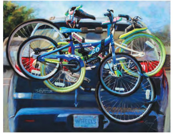
'Bikes #4, Green' Pastel - 16 x 20

“As I continue to travel for my portrait sittings, exhibits, lectures, and workshops, I encourage artists to learn new techniques, experiment constantly, expand your experiences, and deliberately make time in your busy lives to create. Then go to your painting space, quiet yourself, look inward, and allow the art to flow through the pastel. Use whatever means you must employ to make better art.”