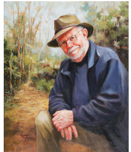
'Acquaviva' Oil - 24 x 18