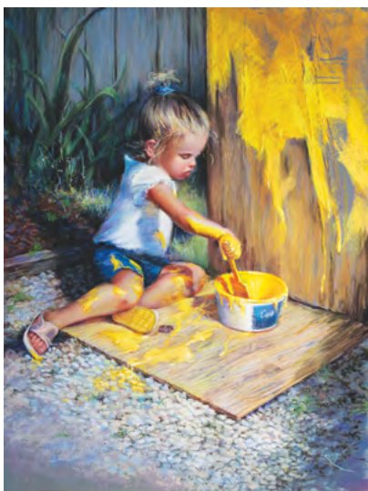
'The Lemonade Stand' Pastel - 24 x 18