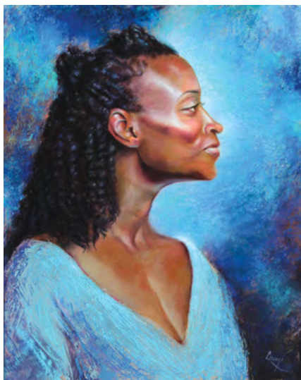
'Turquoise Robe' Pastel - 20 x 16