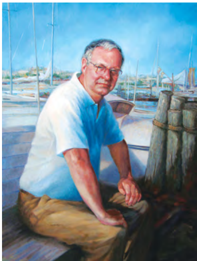
Left: 'Son of a Fisherman' Oil - 42 x 36