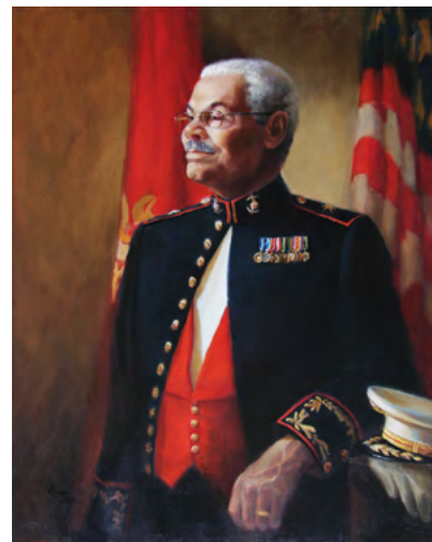
'Brigadier General George Walls' Oil - 30 x 24