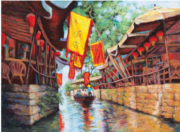
Above: Restaurants on Canal in Tong Li Suzhou, China - 18 x 24